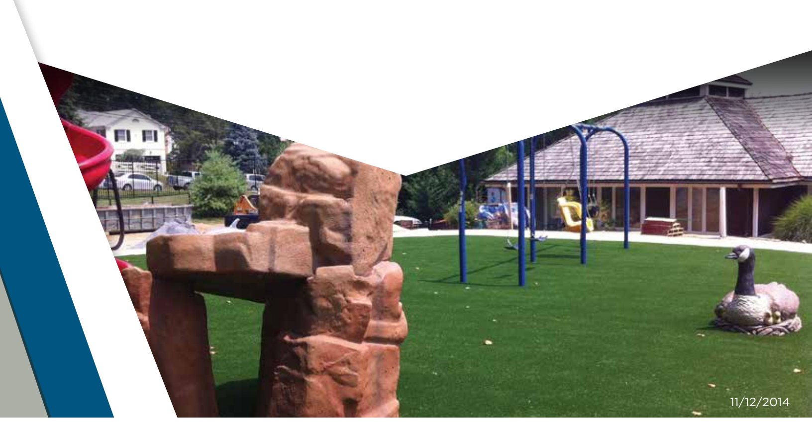
It is the policy of SporTurf™ to continuously improve it line of products. Therefore, SporTurf™ reserves the right to change, modify or discontinue systems, specifications and accessories of all products at any time without notice or obligation to purchaser.