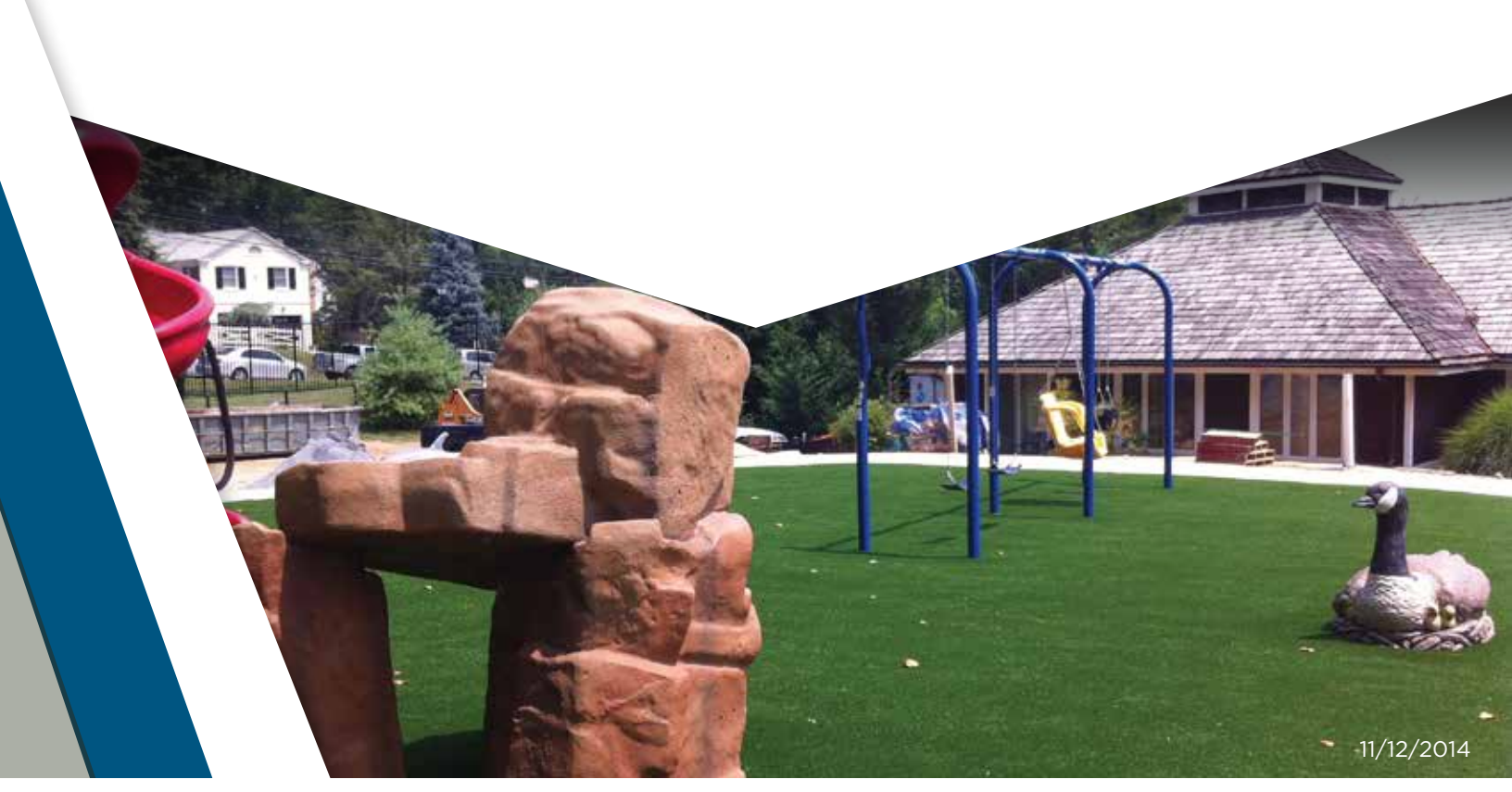
It is the policy of SporTurf™ to continuously improve it line of products. Therefore, SporTurf™ reserves the right to change, modify or discontinue systems, specifications and accessories of all products at any time without notice or obligation to purchaser.